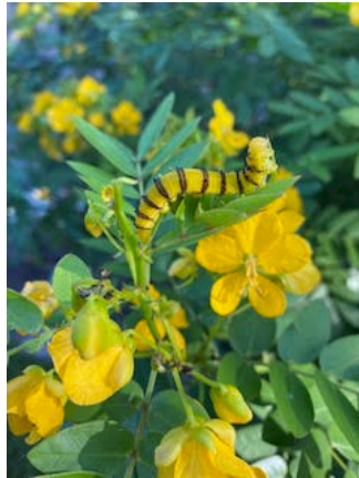
Bahama Cassia with a Yellow Sulphur Caterpillar